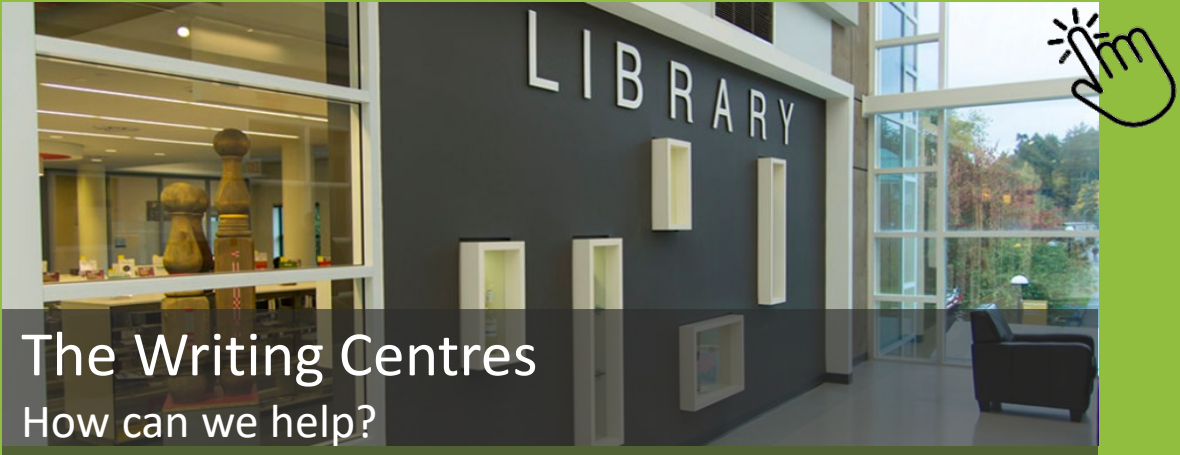
The Writing Centres How can we help?