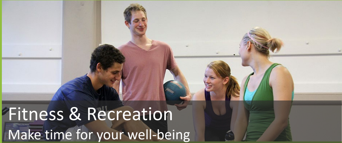
Fitness & Recreation Make time for your well-being