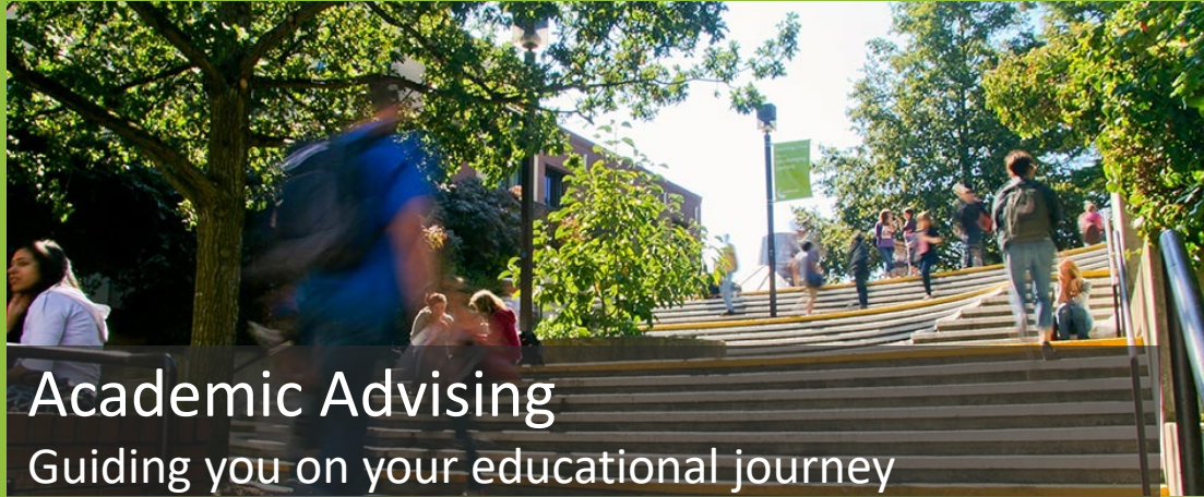
Academic Advising Guiding you on your educational journey