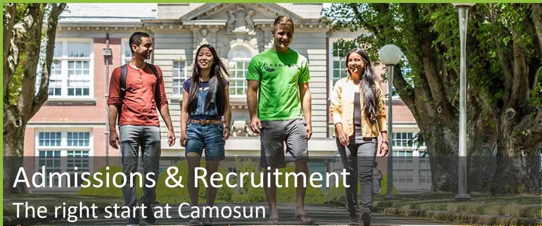
Admissions & Recruitment The right start at Camosun