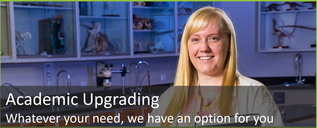
Academic Upgrading Whatever your need, we have an option for you