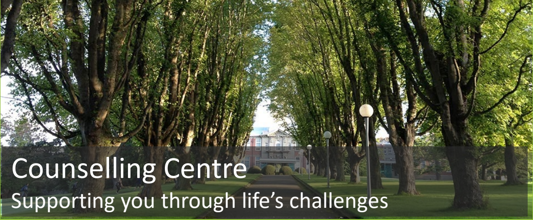
Counselling Centre Supporting you through life's challenges