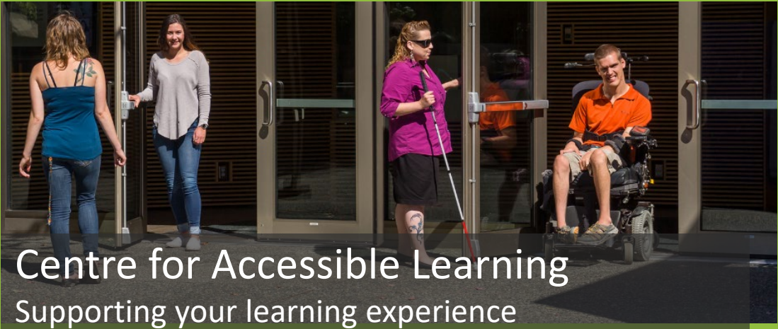
Centre for Accessible Learning Supporting your learning experience