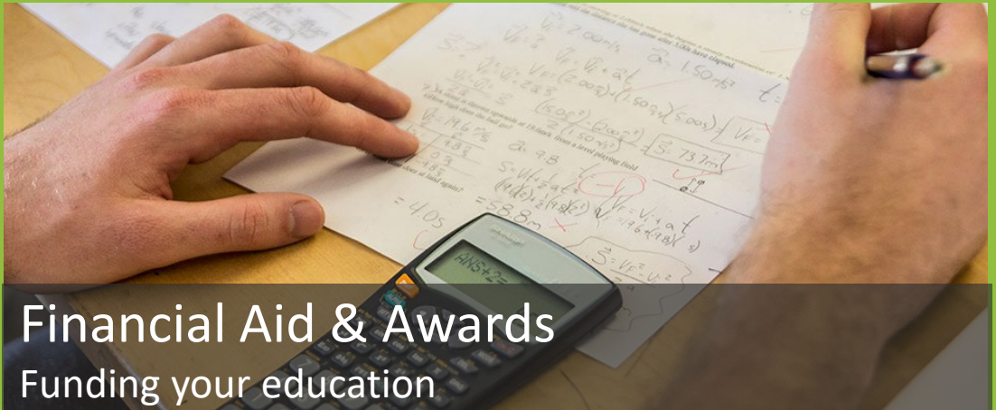
Financial Aid & Awards Funding your education