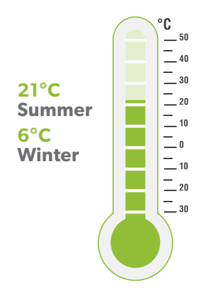
SOME OF THE MOST MILD WEATHER IN CANADA